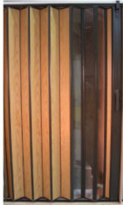
THREE VISION ACCORDION GATE